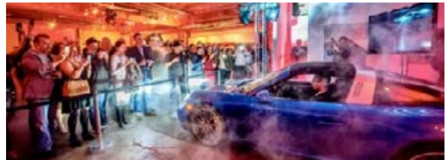
TABLE MANNERS DC / TABLEMANNERSDC.COM / 301.277.0582 / INFO@TABLEMANNERSDC.COM / IG: @TABLEMANNERSDC